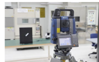
Auto-tracking durability test against rotating object.